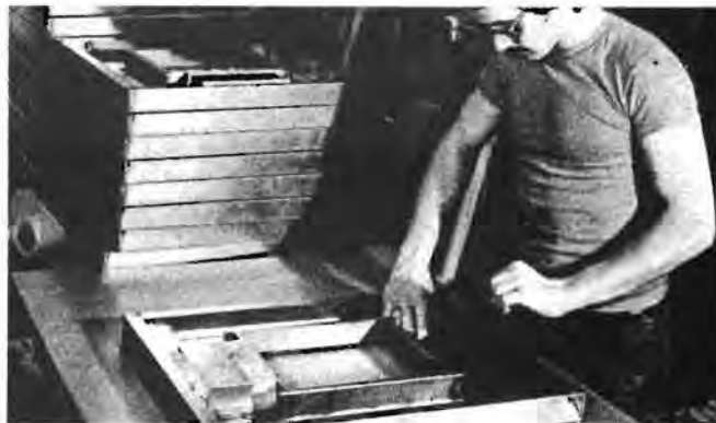
The TEC Damping Sheet is easily and quickly applied to fabricated metal parts.

ECONOMIC - With the TEC Damping Sheet, protection from a variety of occupational noise problems is readily achieved, at a much more reasonable cost than with lead-based sound absorption materials.